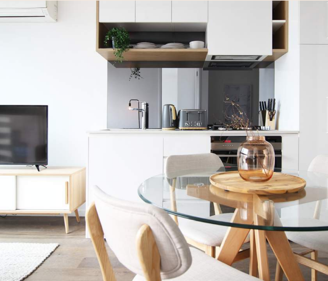
PROJECT | The Carlton

Interiored specialises in providing interior solutions for small apartments.